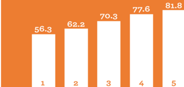
This graph produced by the Get Georgia Reading Campaign.

The Georgia Department of Education (GaDOE) reports that there is a 25.5 point difference between schools with a 1-star and those with a 5-star on Georgia's School Climate Rating system for the 2016-2017 school year. In the area of English Language Arts (ELA) proficiency, the difference between schools with a 1-star and those with a 5-star rating is 30.5 points.