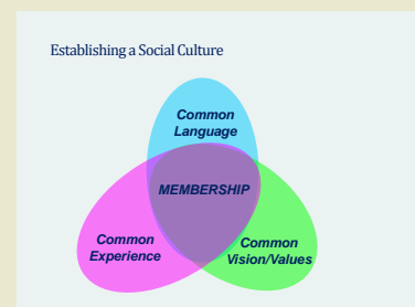
School-wide Social Culture